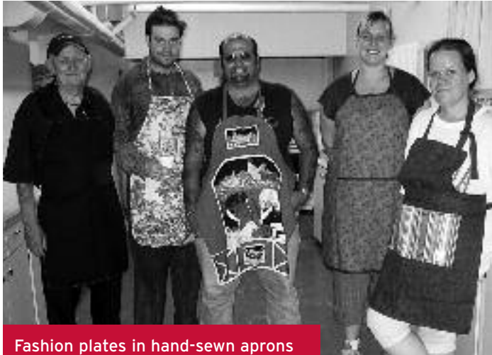
Fashion plates in hand-sewn aprons from Darrell Thomas Textiles

Centre 507 and Darrell Thomas Textiles cater to different crowds. His